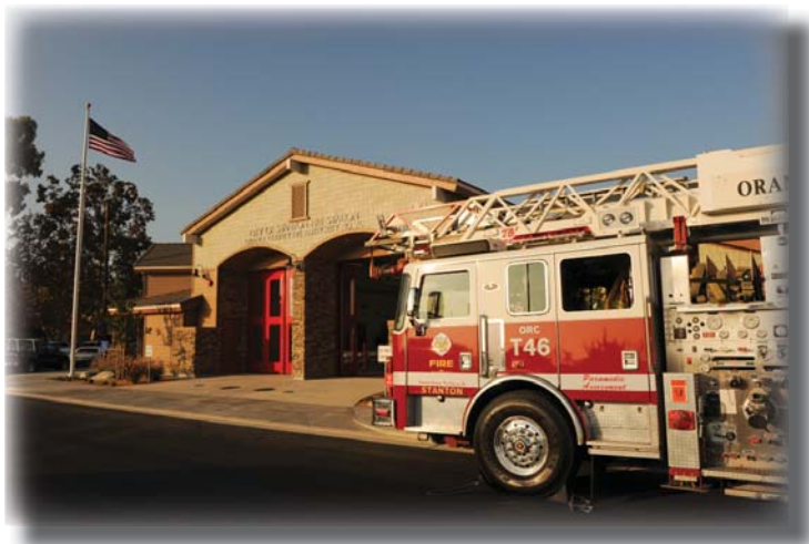
Truck 46 parks outside its new home!