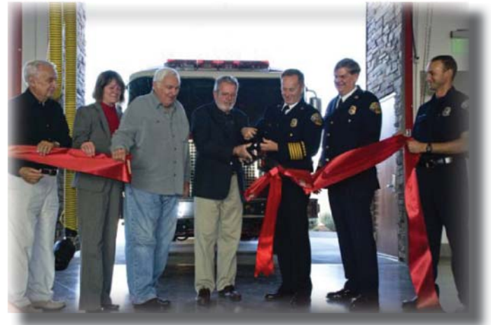
Dignitaries cut the ribbon to officially open Fire Station 46 in Stanton.