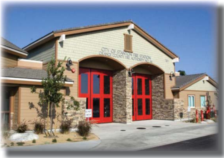
The outside of new Fire Station 46 includes drought tolerant landscaping.

Crews are now moved into the new station and keeping the community safe with their fire and emergency medical responses.