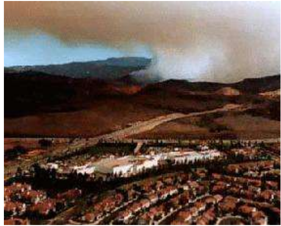
The Fire Threatens East Orange