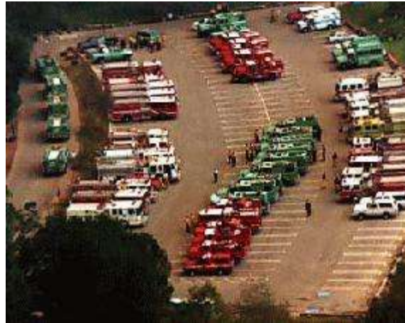
The Apparatus Staging Area