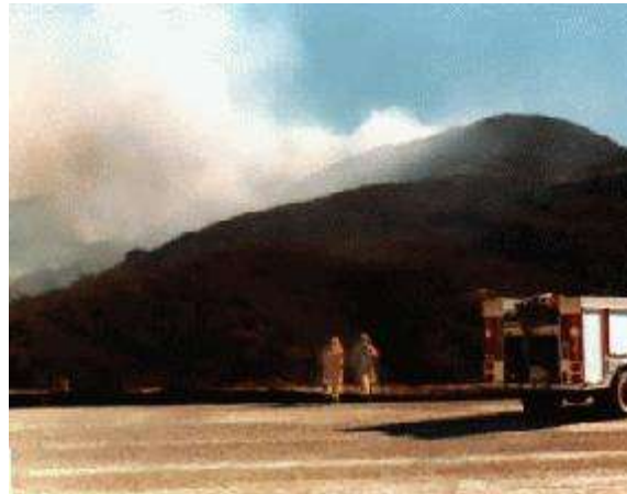
OCFA Engine 307 and Company