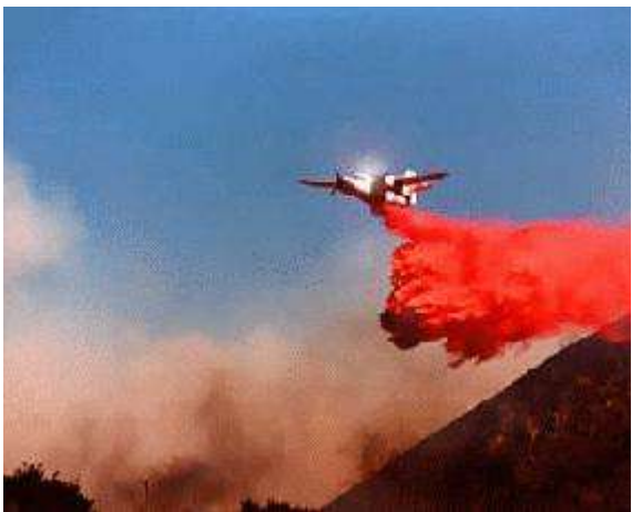
CDF Air Tanker