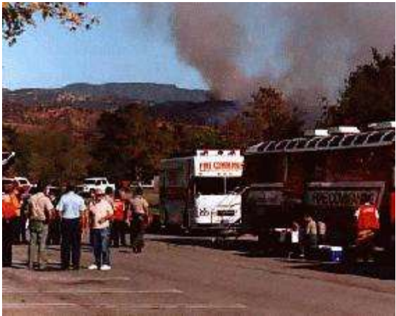
The Command Center